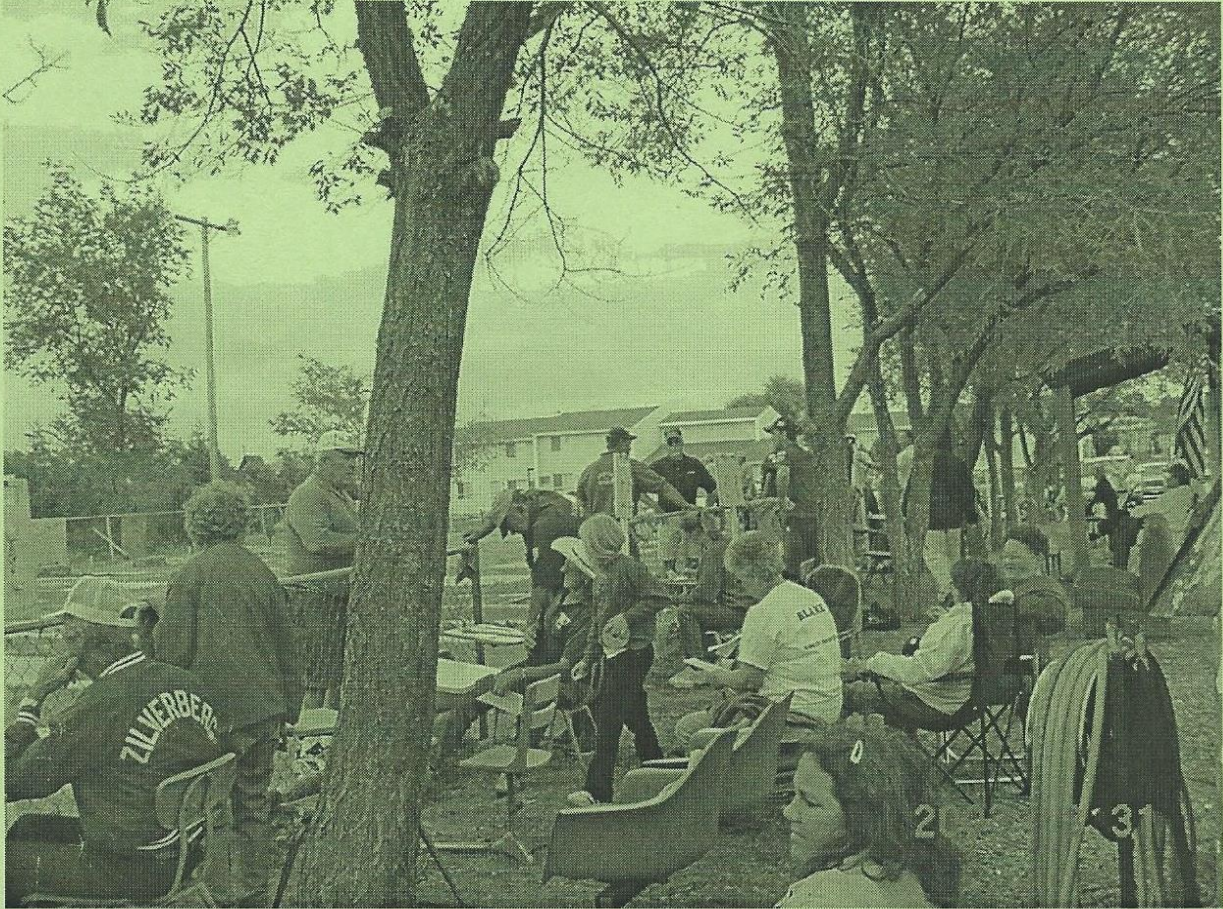
Belle Fourche Horseshoe Courts