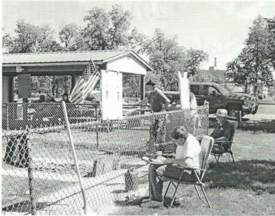
2010 State Horseshoe Tournament Pierre SD