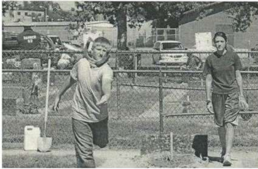
2011 State Tournament Pierre South Dakota