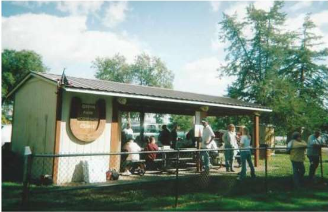
2013 State Tournament Pierre South Dakota